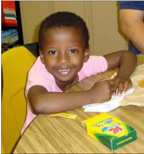
Working for a child's smile