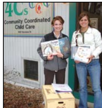
Teacher Education students lead book drive for local community.

"I think education fundamentally is about giving back and that is not only in the classroom, but outside of the classroom as well," she said. "It's a good idea for us to get out into our community and get to know it."