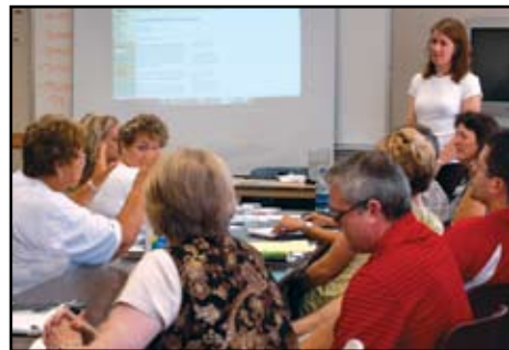
Summer school participants engage in valuable professional development workshops.

"I learn a multitude of different skills that I apply to my work," she said. "The instructors do more than just present the information. They also provide guidance on how to apply these techniques in the field."